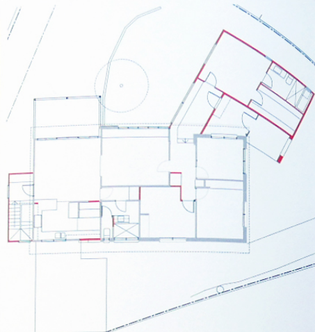
Ground floor plan after renovation